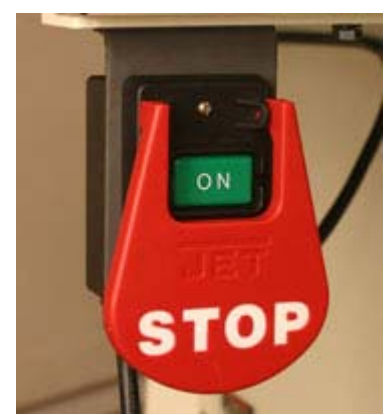
The large paddle-style OFF switch makes it easy to shut the ProShop saw off by hand or with a bump of your leg.

The JET ProShop 10" Table Saw is available in several versions designed to fit a wide range of shop size and project needs. The JET ProShop 10" Table Saw can be equipped with the 30" or 50" fence system, steel or cast iron extension wings and with or without the XACTA-Lift router plate in the extension wing. Whatever your current or future shop needs, we have a JET ProShop 10" Table Saw that will work for you today and decades down the road.